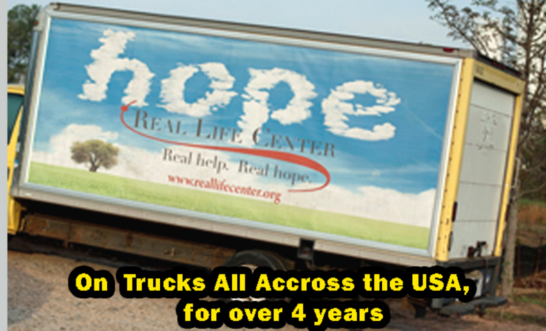
On Trucks All Accross the USA, for over 4 years

Billboarder Uses low Cost E-Z ON - E-Z OFF BANNERS instead of the usual "stuck to the truck" High Cost Glue On-Graphics