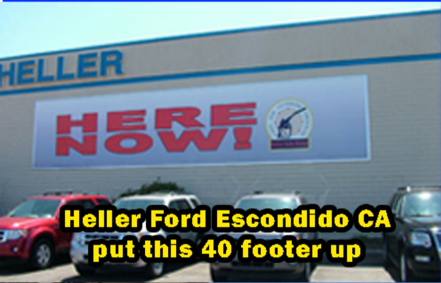
Heller Ford Escondido CA put this 40 footer up