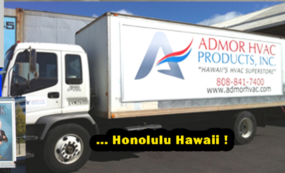
... Honolulu Hawaii !